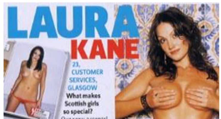
FHM Dec 2005

As with much of pornography, there is incessant emphasis on real women not fantasy.