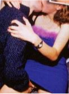
Caption: "He was in for a shock when her dad got home ! (they have the same dad)'