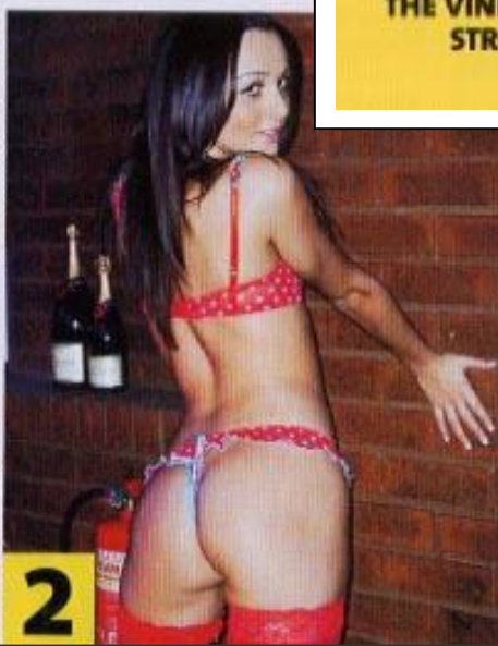
Caption: "... Victoria looks good for a girl who might be waking up from a drugging .."