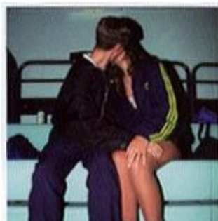
Caption: "Practising for when they're allowed to mix with non-siblings "