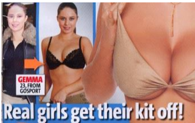
Nuts Front Cover : 18-24 Feb 2005