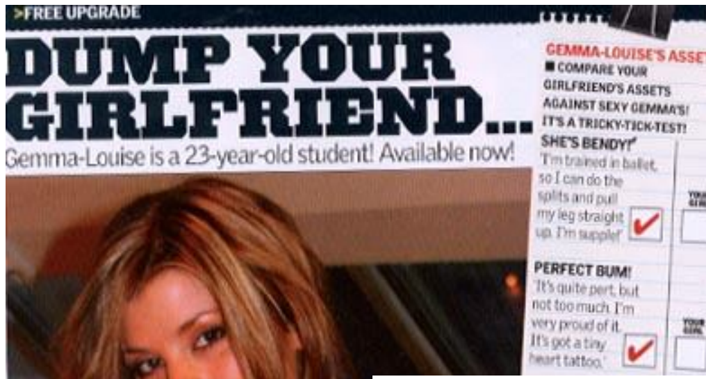
Maxim: April 06